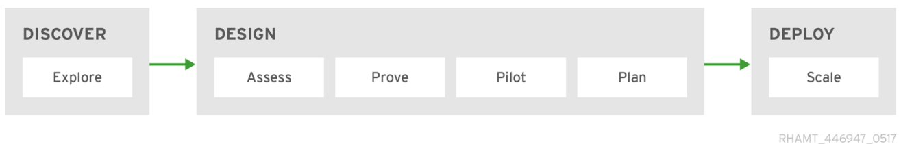
Figure 6.1. Red Hat migration methodology

The approach consists of the following phases: