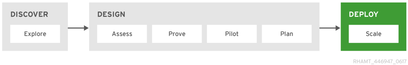
Figure 6.4. Red Hat migration methodology: Deploy phase

The Deploy phase is when you run the plan created in the Design phase. In this phase, you scale the overall transformation process to complete the plan and bring all applications to their new production environment.