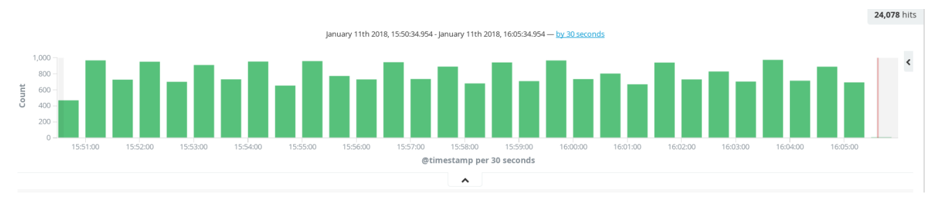
Figure 3.1. Histogram

The distribution of documents over time is displayed in a histogram at the top of the page. By default the information is grouped into 30 second intervals, but this can be changed by clicking the time dropdown list that appears above the histogram.