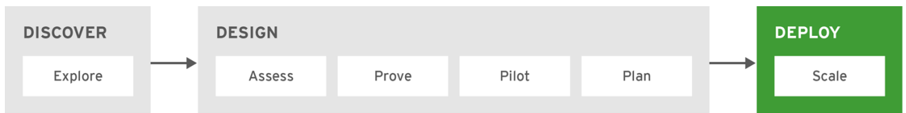
Figure 6.4. Red Hat migration methodology: Deploy phase