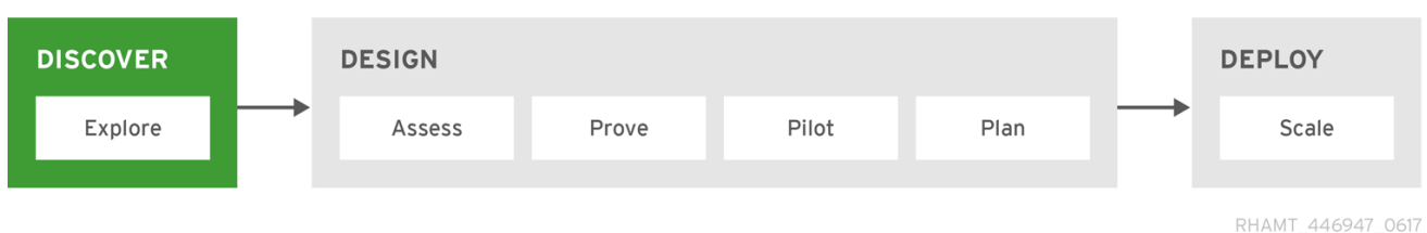
Figure 6.2. Red Hat migration methodology: Discover phase