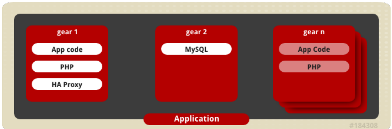
Figure 10.1. Cartridges on Gears in a Scaling Application

When the application (by default) reaches three copies of the web framework cartridge, the HAProxy load-balancer disables routing to the framework cartridge located on the same gear. This gives the HAProxy cartridge full gear resource usage, which continues to route requests to the framework cartridges located on separate gears. Routing to the framework cartridge located with the HAProxy cartridge is enabled again once the application is scaled down.