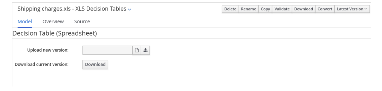
Figure 6.1. Uploaded decision table options

You can upload a new version of the decision table or download the current version: