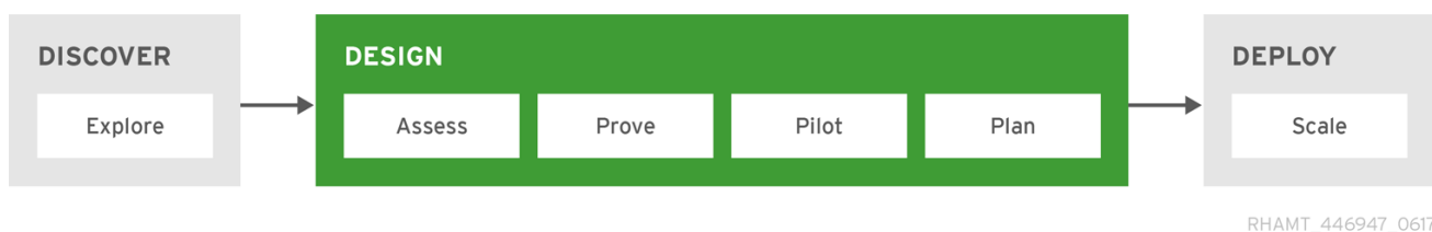
Figure 5.3. Red Hat Migration Methodology: Design Phase

The Design phase is when you identify all risks, define a strategy and target architecture, prove the technology, and build the business case. This phase consists of the following steps: