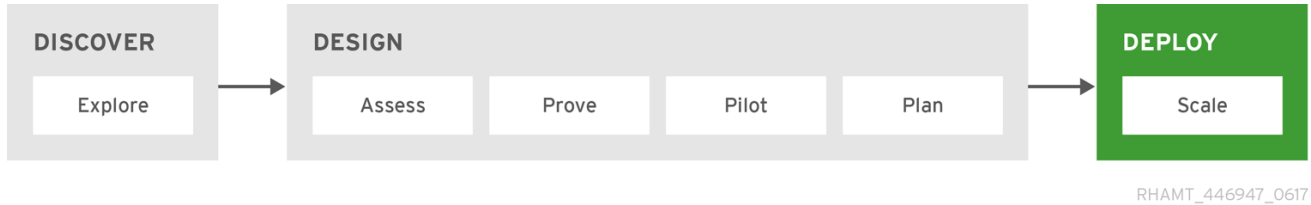
Figure 5.4. Red Hat Migration Methodology: Deploy Phase

The Deploy phase is when you execute the plan created in the Design phase . In this phase, you scale the overall transformation process to complete the plan and bring all applications to their new production environment.