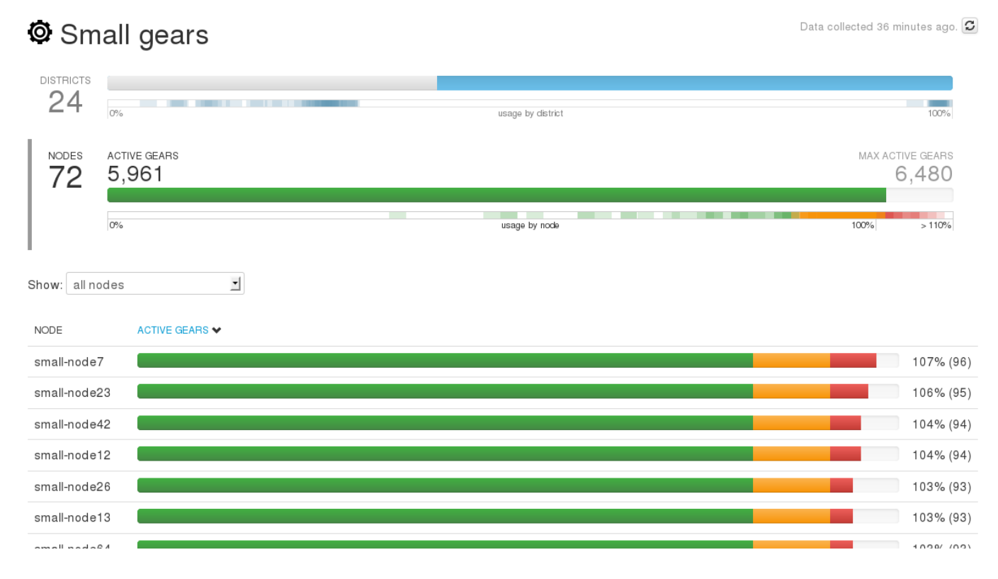
Figure 7.3. Gear Profile Nodes View

Each gear profile page's NODES view shows all nodes in that gear profile, and by default sorts by the fewest active gears remaining. A progress bar indicates how many active gears the node is using; a full bar is 110% or more of the active capacity. The bars transition to orange when it reaches the configured threshold, and transitions to red for nodes that exceed their active capacity. The Show drop-down menu allows you to filter the nodes displayed, with the options for either all nodes in the gear profile, only nodes in a particular district, or nodes that are currently not in a district. Selecting a node takes you to the node's summary page.