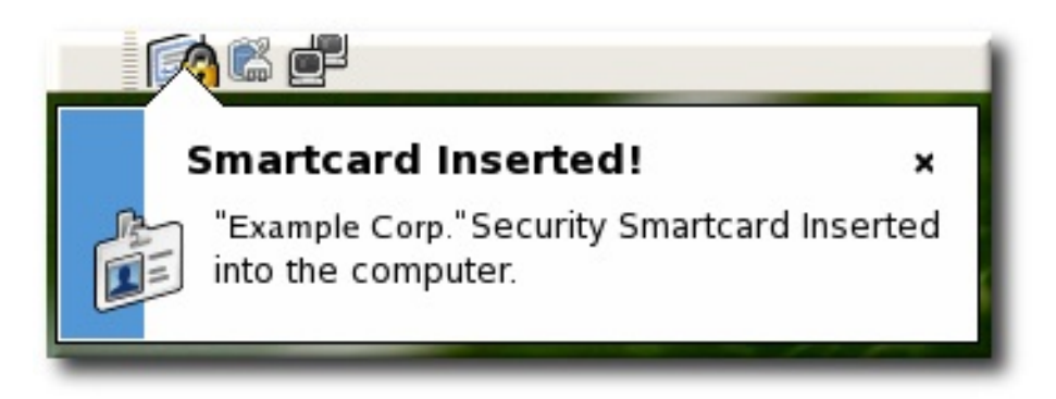
Figure 3.1. Example Token Tray Icon and Tooltip

Many programs maintain an icon in the tray or notification area which can be used to control the operation of the program, usually through context menus when right-clicking the icon. The Enterprise Security Client provides tray icons, including tooltips for errors and actions such as inserting or removing a smart card.