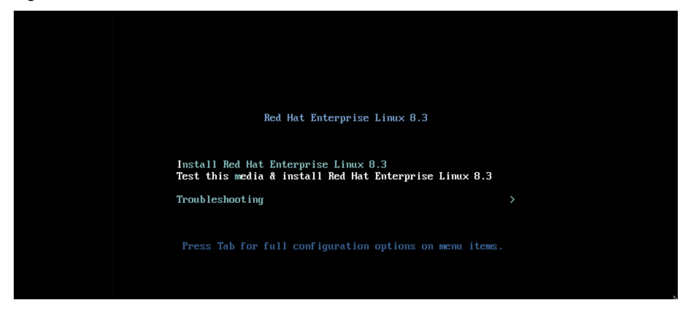
Figure 3.1. ISOLINUX Boot Menu

The isolinux/isolinux.cfg configuration file on the boot media contains directives for setting the color scheme and the menu structure (entries and submenus).