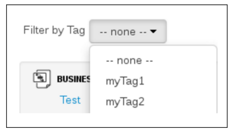
Figure 6.5. Filter by tag

You can sort your assets through this filter to display all assets and service tasks that include the selected metadata tag.