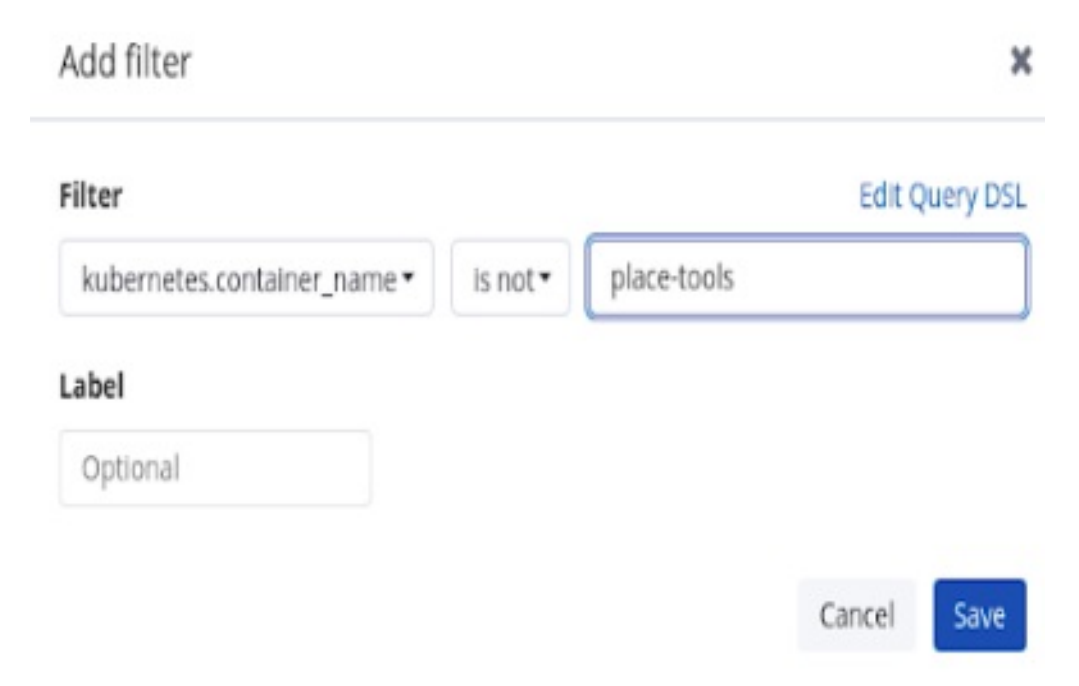
Figure 2.1. Example of filtering using the drop-down fields

iii. Filter pipelinerun in labels for highlighting: