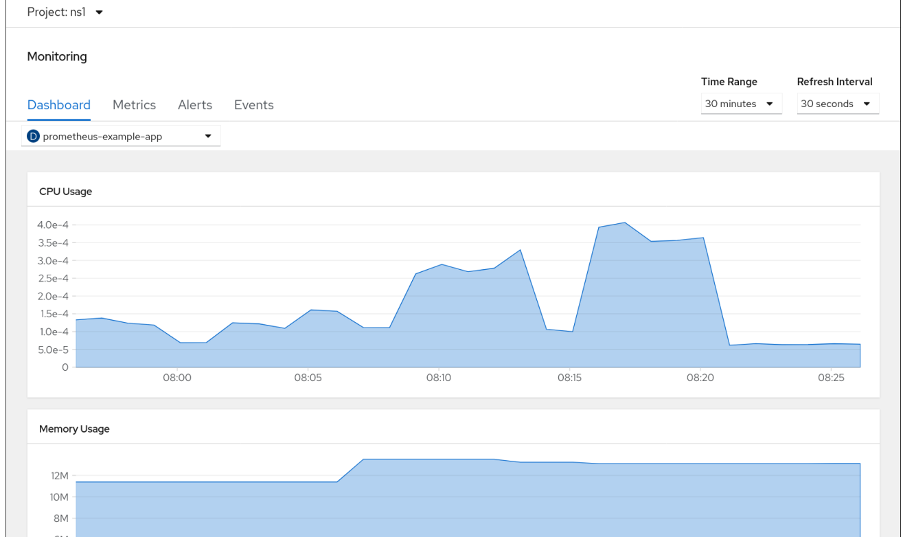
Figure 6.2. Example dashboard in the Developer perspective