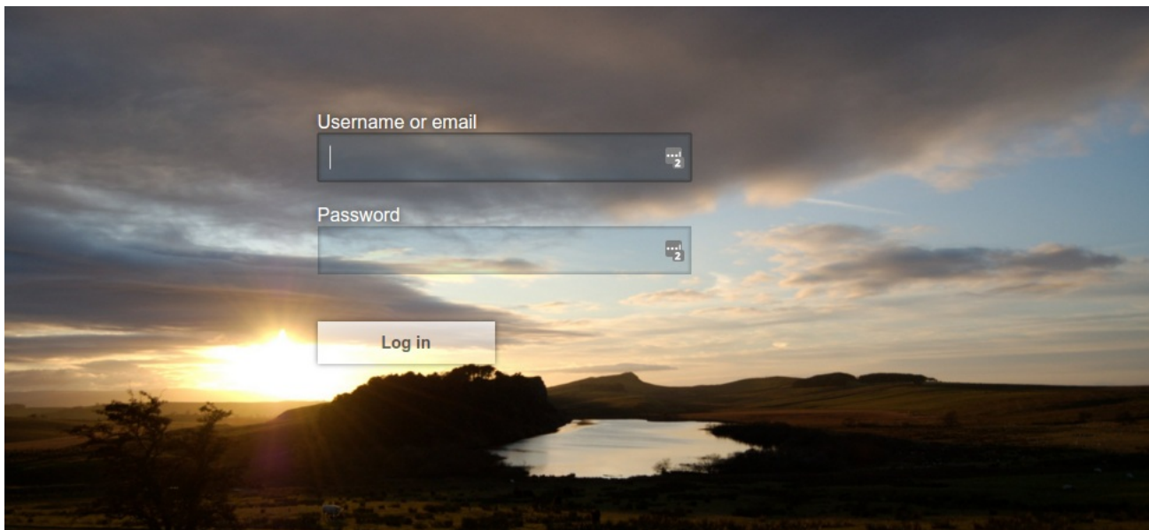
Figure 3.1. Login page with sunrise example theme

Red Hat Single Sign-On provides theme support for web pages and emails. This allows customizing the look and feel of end-user facing pages so they can be integrated with your applications.