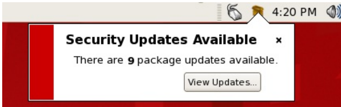
Figure 2.2. Package Updater Applet

Red Hat Enterprise Linux 5 features a running program on the graphical desktop panel that periodically checks for updates from the RHN or Satellite server and will alert users when a new update is available.