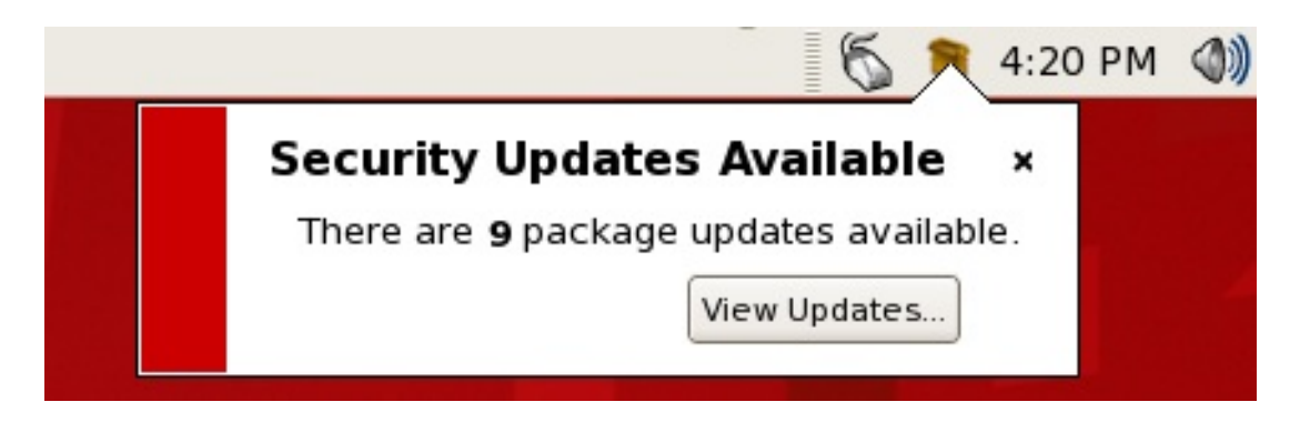
Figure 2.2. Package Updater Applet

Red Hat Enterprise Linux 5 features a running program on the graphical desktop panel that periodically checks for updates from the RHN or Satellite server and will alert users when a new update is available.