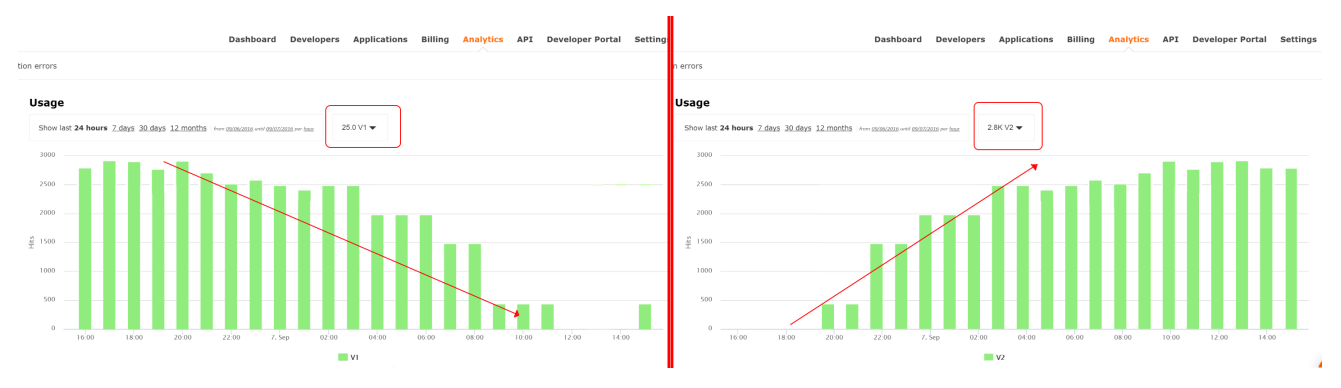
Figure 6.3. Versioning

If some users continue to use v1, you can filter out only those users to send another internal note about switching to v2.